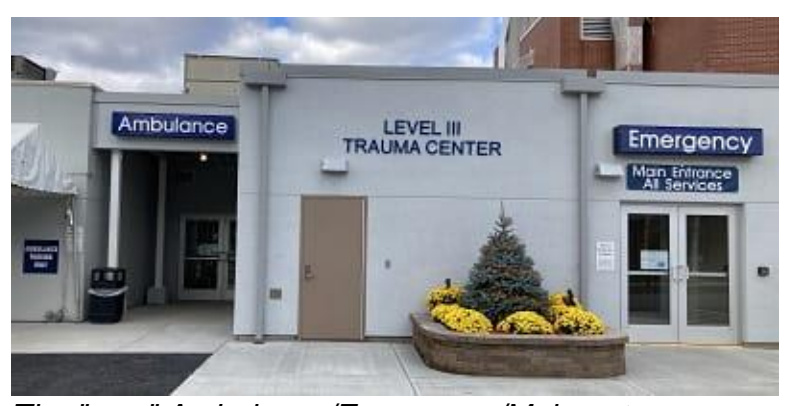
The "new" Ambulance/Emergency/Main entrances officially open their doors on 10-17-22.