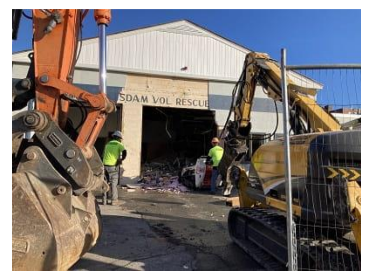
Signage from years past is uncovered during demolition of the Materials Management office.