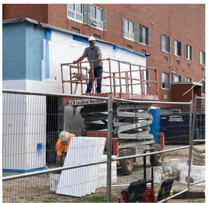
Progress continues on the new Cottage Street entrance to CPH. (9-7-22)