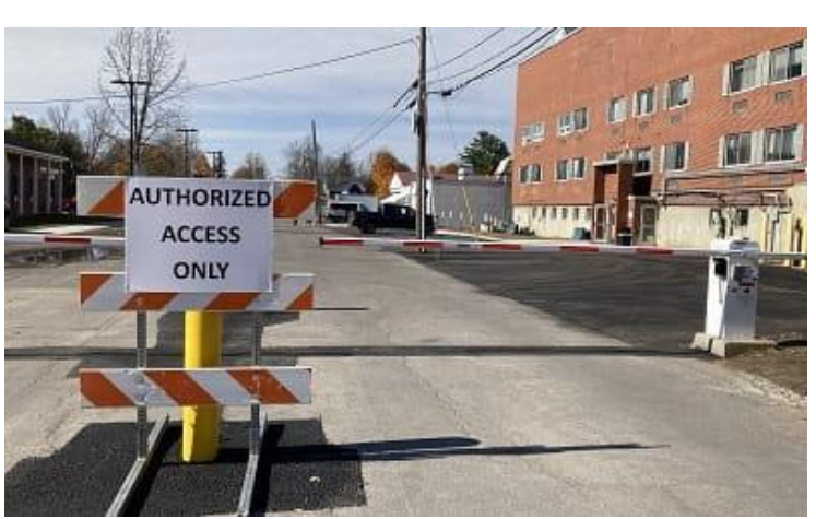
Crossing arms are installed at the end of Cottage Street at intersection with Leroy Street. (10-24-22)