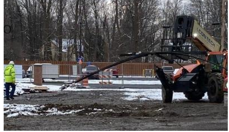
A project behind the 20 Cottage Street building on the main campus. (11-18-22)