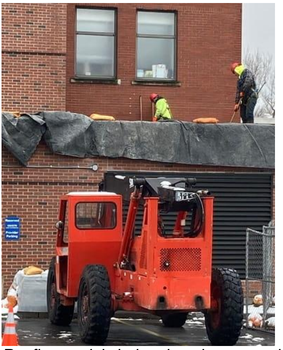
Roofing work is being done in preparation For a new switchgear. (11-16-22)