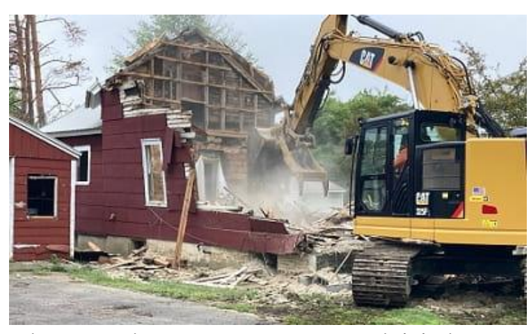
Houses at 13 Grove (white house) and 15 Grove Street (red house) are being demolished. (8/8/22)