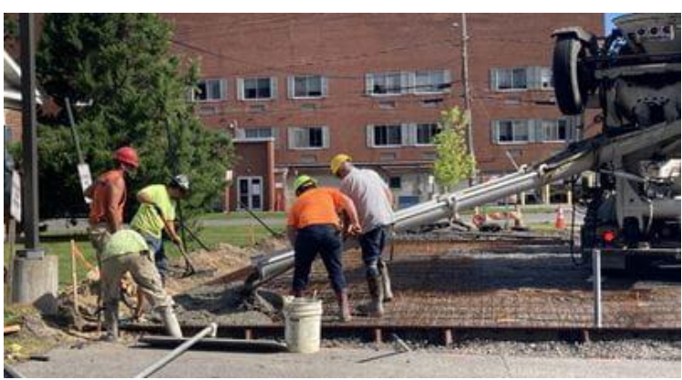
Cement is being poured for the new compactor pad at 25 Cottage Street. (7/26/22)