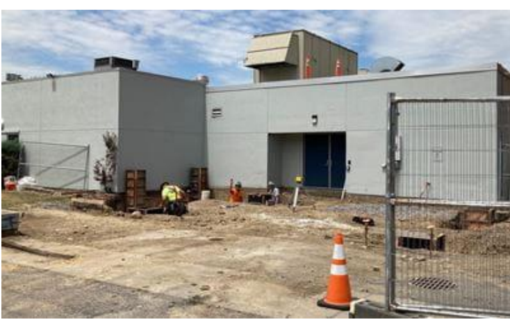
Work is underway on the temporary entrance on the Cottage Street side of the Hospital. (7/11/22)