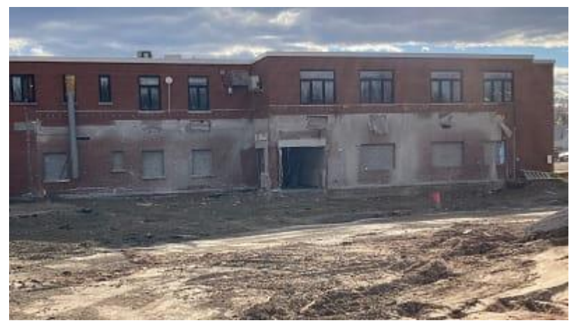
All that remains of the former main entrance. (11-7-22)