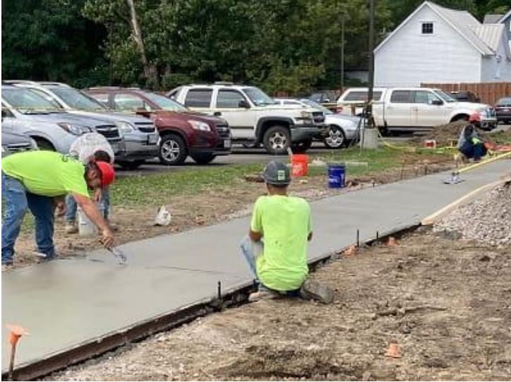
A new sidewalk is poured and prepped on the south side of Cottage Street. (9-7-22)