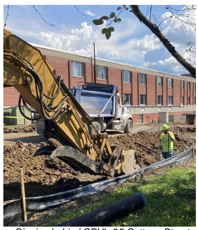
Digging behind CPH's 25 Cottage Street professional building. (8/19/22)