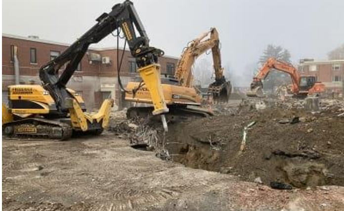
Heap of metal that was the main entrance canopy. (11-2-22) Former main entrance undergoes demolition