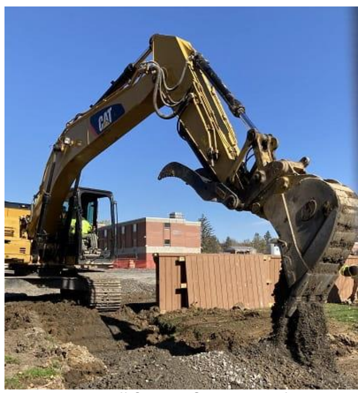
Backhoe work off Cottage Street at the former back lot near the ER. (10-21-22)