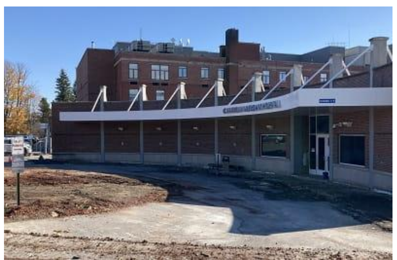
The old entrance area is looking much different.